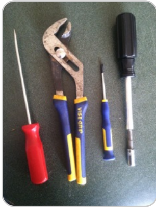
Step 1: Tools Needed Items: 7mm socket, Chanel locks, Screw drivers