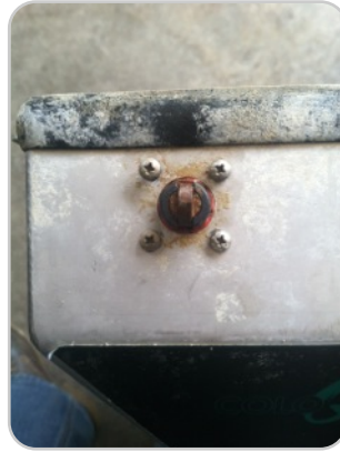
Step 2: Remove Switch Remove the old switch by removing the four mounting screws, keep these screws