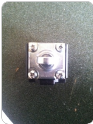
Step 6: Remove mounting screws Remove the four screws from the top of the new lid switch, these are too short and will be replaced with the old screws