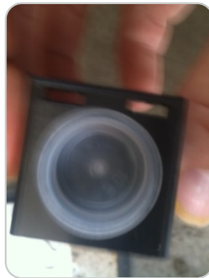
Step 7: Remove plug Remove the plug from the bottom of the new switch. Remove the wire cover (like in step 3).