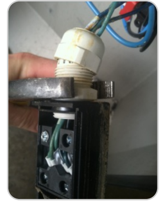
Step 5: Remove wire retainer Unscrew both the cap and wire retainer from the lid switch.