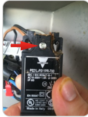
Step 3: Remove wire cover Remove the screw holding the wire cover on.