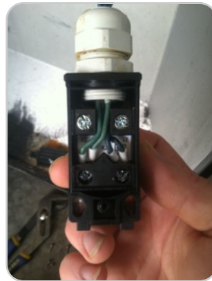
Step 8: Re-assembly Items: Insert the wires into the new switch making sure wires of the same colors are together. Replace wire retainer and cover. Do not over tighten wire tainer