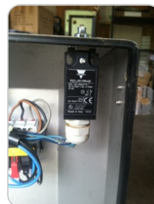
Step 9: Install Items: In stall the new switch using the four old screws.

When working on any wiring in this unit make sure to turn it off and un-plug it!