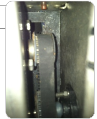
Step 5: Replace the belt Replace the belt and re-install the motor mount.