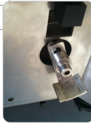
Step 3: Remove sensor Remove the motor sensor and sensor arm.