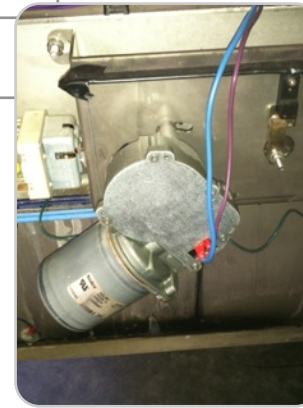
Step 4: Remove motor mount Remove the four bolts holding the motor mount on.