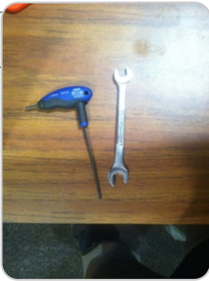
Step 1: Tools Needed Items: 10mm wrench, 2.5mm allen wrench